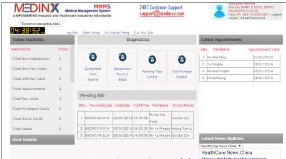
Fig: Diagnostics Modules

*Subject to opting for the MedinyX Pads solutions